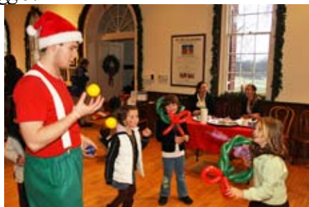
A Lesson in Juggling!

A record number of families attended. They were wowed by the Cartoonist, the Balloon Artists, the Face Painters and the Juggler.