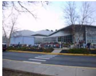
Students donated more than a ton of Turkeys & nearly 1600 canned goods