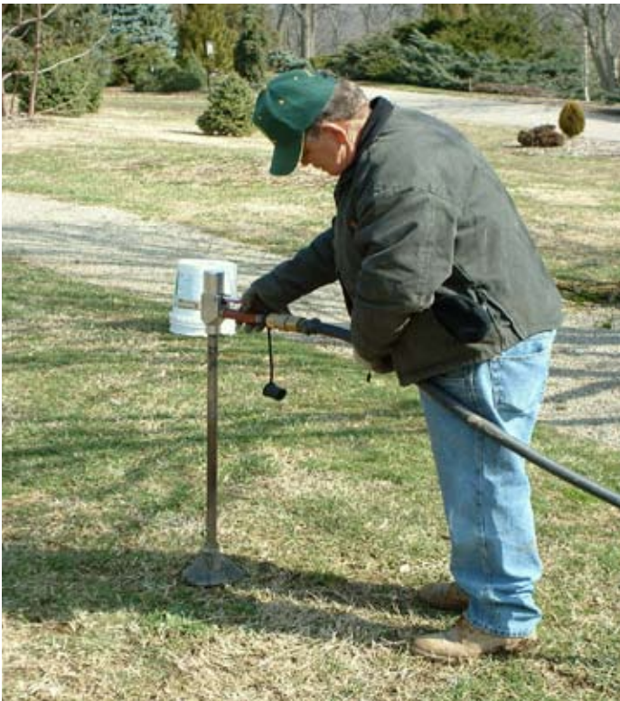
High Pressure Air injected into the soil for better fertilizer uptake.