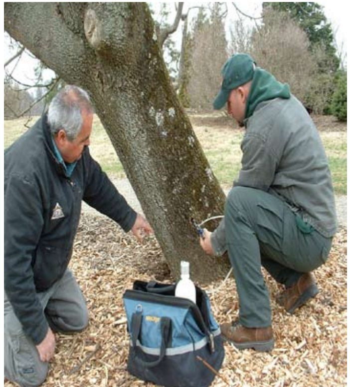
Arborjet Direct Injection of insecticide into tree

In 2008 three of our specimen ash trees were treated to protect them from the invasion of the Emerald Ash Borer (EAB). Tim Back and members of his crew visited the Arboretum on two separate occasions to donate a full program of treatments to what Mr. Back guarantees as protection from an attack of the EAB.